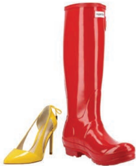
SHOES & BOOTS